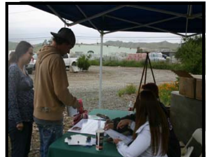
Sisters also help out with event check in and food giveaway